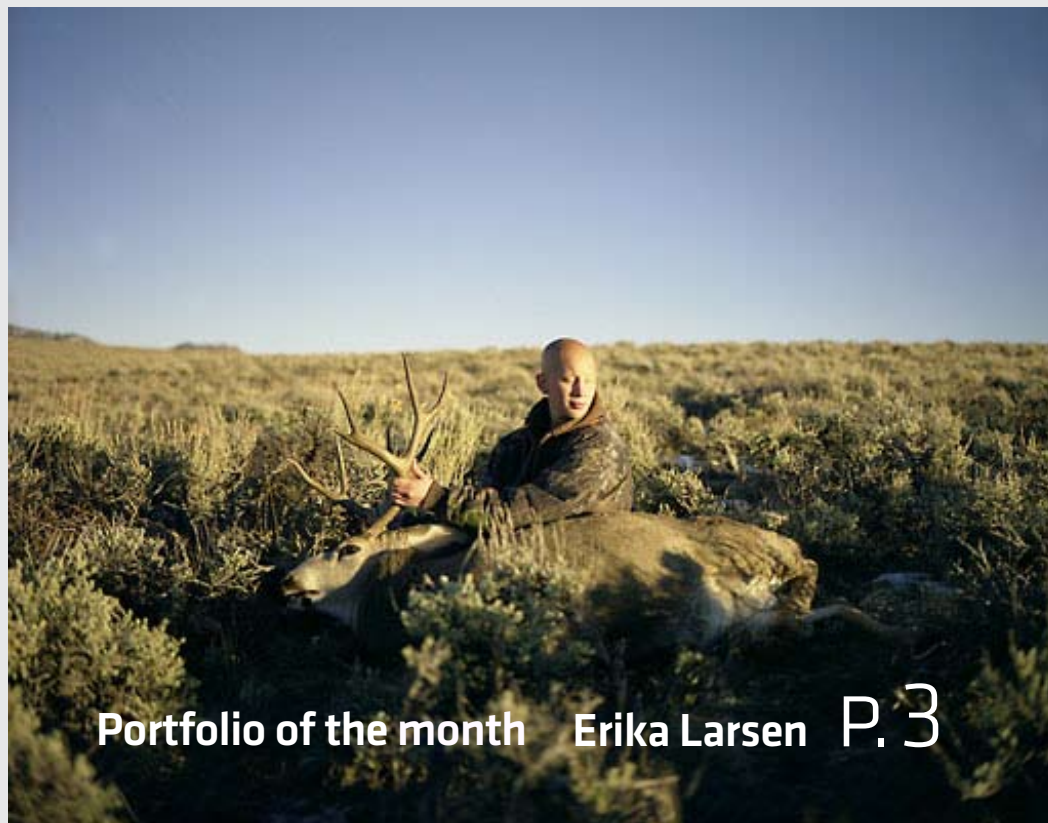
Portfolio of the month Erika Larsen P. 3

Bildbyrån Silver T +46 8 643 05 30 Igeldammsgatan 20 info@bildbyransilver.se 112 49 Stockholm www.bildbyransilver.se